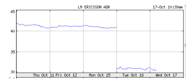
Figure 2 A 25% Gap in Ericsson, one of the Most Liquid Stocks in the World. Such move can dominate hundreds of weeks of dynamic hedging.